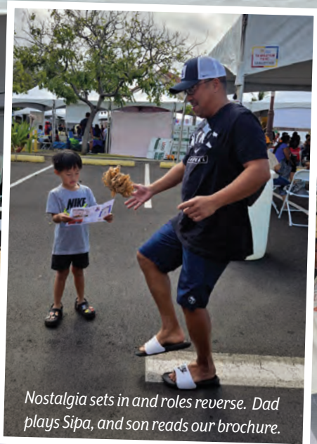
Nostalgia sets in and roles reverse. Dad plays Sipa, and son reads our brochure.