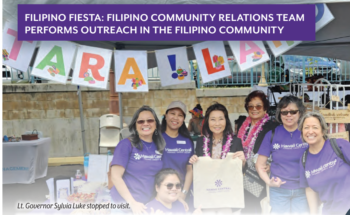
Lt. Governor Sylvia Luke stopped to visit.

The Hawaii Central Federal Credit Union Filipino Community Relations Team (Filcom Team) was out in full force at the Filipino Fiesta held at the Filcom Center in Waipahu on Saturday, May 4th. Members of our Filcom Team worked throughout the day—alongside volunteers from our Consumer and Home Loan departments—and performed outreach to raise awareness around products and services that can add value to and benefit members of the Filipino community like offering financial services in Tagalog, Bisaya, and Ilocano.