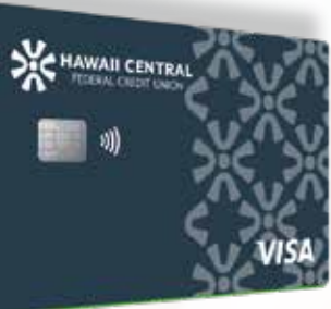
Visa Platinum Cash Rewards Credit Card

*Hawaii Central Federal Credit Union membership eligibility required. Student Loan applicants must complete a Free Application for Federal Financial Aid (FAFSA). Certain requirements and restrictions apply. Call our consumer loan department at (808) 536-0833 for more information.